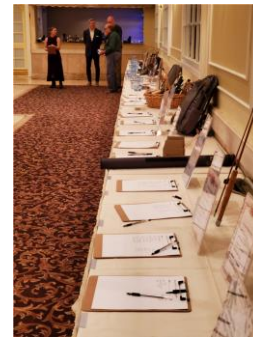
A total of 38 prizes were awarded at the party. A partial display of "Silent Auction" & "Bucket Raffle" items is pictured.

OBTU continued the tradition of a holiday raffle with a few weeks of online and in-person ticket sales leading up to Grand Prize drawings at the Party. This year's Grand Prize winners: