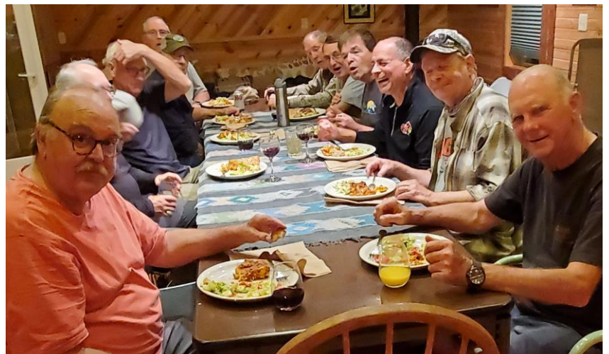
2023 Group Saturday Dinner at Nature Nooks Retreat