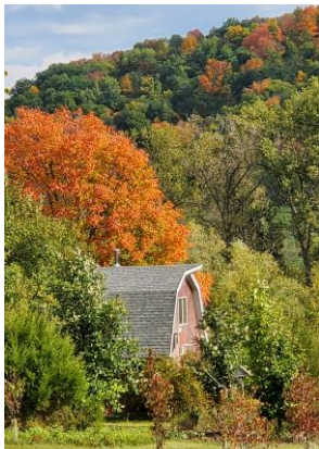
Fall Color at NNR