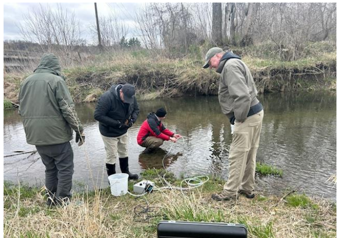
OBTU volunteers pilot the chapter's new eDNA testing equipment.