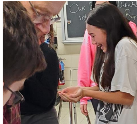
At times Science can be distressing!