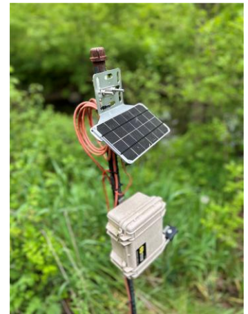
Solar-powered EnviroDIY Station on Dowagiac & Coldwater Rivers transmit real-time data to the web.

OBTU has long supported dam removal, stream improvement, and monitoring work on the Dowagiac River located near Niles, Michigan. This year we assisted in the installation of two solar-powered EnviroDIY Monitoring Stations that transmit real-time data across cellular networks to the web. Sensors in these stations will monitor water temperature, depth and conductivity allowing better understanding of the impact of development and agricultural activity within this predominantly cold-water system. Other organizations partnering on Dowagiac projects include MEANDRS, Kalamazoo & Donnelly TU chapters, St Joseph River Valley Fly Fishers (SJRFFF), Cass County Conservation District, Cass County Parks, and Trout Unlimited National.