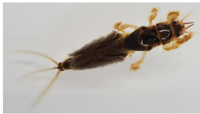
Hexagenia Mayfly Nymph, A burrowing mayfly. Note the "digging" mouth parts.