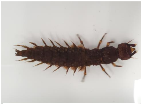
Hellgrammite (up to 3+ inches) A Dobson Fly Nymph.

During April 2 thru 10 our team conducted "Wet Bug" lessons for a total of 28 participating classes as requested by nine of OBTU's TIC schools. As in the past, Dean Hansen, SE Minnesota-based Entomologist, captured the aquatic insects for us including large stone flies, hexagenia mayfly nymphs, hellgrammites, case caddis nymphs, as well as clinging and swimming mayfly nymphs. Dean does a wonderful job of capturing exceptional specimens. With Dean's retirement, Marvin Strauch travelled north to pick up and transport the live bugs which must be kept in separate cold water, oxygenated storage vessels to keep them in a lively state for hands-on, live bug study in the classrooms for a two-week period. About 25 OBTU volunteers assisted with mentoring in the 2024 wet bug classrooms. Some of the stars of the wet bug program are pictured: