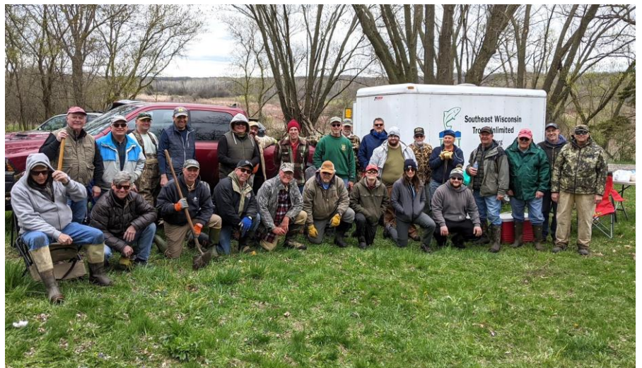
OBTU & SEWTU planted trees on Bluff Creek on April 20.

OBTU will again be partnering with our friends at Southeast Wisconsin TU for workdays on Bluff Creek and Karcher Creek in nearby southeast Wisconsin. The workdays generally run from 9:00 am to noon on a Saturday, followed by a traditional brat fry lunch. Work consists of fun things like planting trees, removing invasive plants, cutting down buckthorn and clearing brush away from the stream corridor.