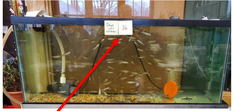
Note the 36-day countdown till “Trout Release Day”. OBTU leads field trips with a stream study program culminating with a release into the stream ceremony. Release field trips took place May 6-10 this year.