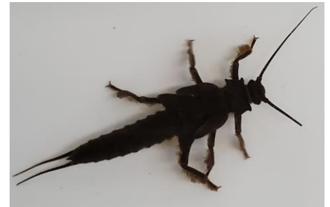
Giant Stone Fly Nymph

Students & school teachers love this program. Pictures describe better than words: