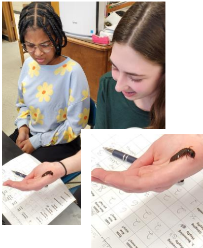
Students record Hellgramite observations on the assigned worksheet.