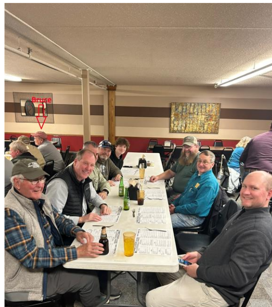
Saturday Night Dinner at Mabe's Pizza----It took two pictures to capture the party. Lots of people sharing a good time!