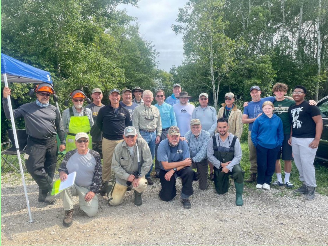
2021's joint SEWTU & OBTU work crew on Karcher Creek.