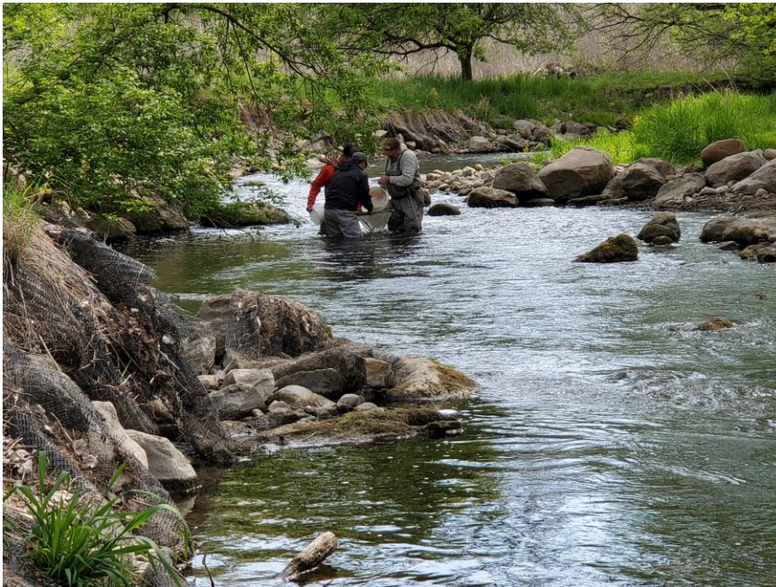
Insect Capture on the Coldwater River near Grand Rapids, Michigan.

OR: Reach out to the appropriate program leader.