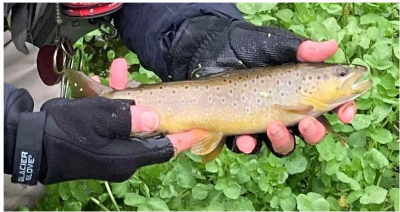
Pan-sized brown coaxed out of very healthy watercress growth on Waterloo Creek near Dorchester, Iowa.