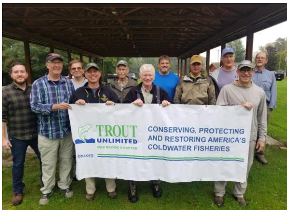
Participants of the Fall 2021 Coldwater Macro Survey

After lunch, many participants take the opportunity to extend their stay and get some fishing in. Seasoned Coldwater veterans are happy to share their knowledge of local "hot spots" on the Coldwater, Rogue, and Muskegon Rivers.