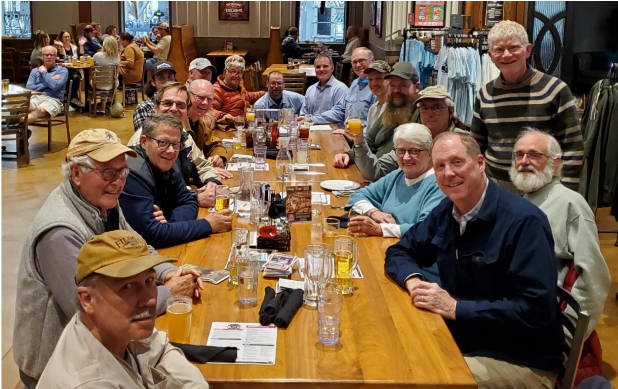
A happy group at Friday evening dinner at the Toppling Goliath Brewery, Decorah, Iowa.