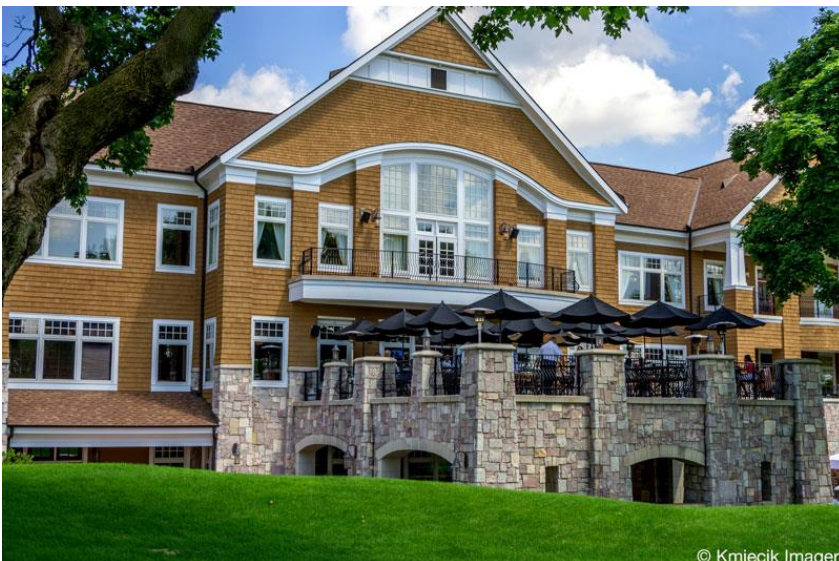
Arrowhead Golf Clubhouse, Site of the OBTU 2021 Holiday Party