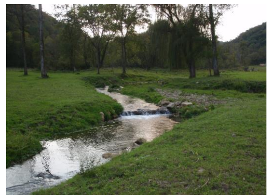
Conway Creek looking good after rehabilitation. OBTU raised substantial funding for this project.