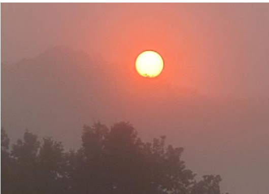
Foggy Sunrise over the bluff as seen from Nature Nooks Retreat on the West Fork Kickapoo