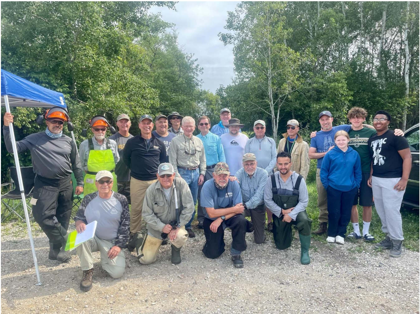
Participants in the 2021 Karcher Creek Workday. Not shown are two Wisconsin DNR staff members who helped with the project.