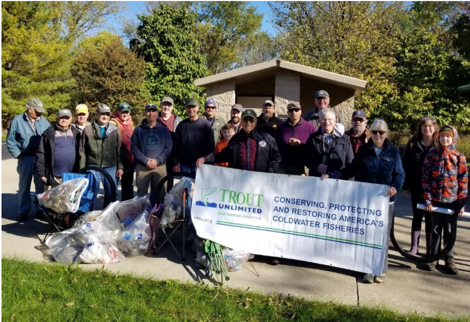
Participants of the Fall 2022 DuPage River Cleanup

DuPage River Cleanup Days are part of the DuPage County Adopt-A-Stream program, which was created to help keep local water resources clean. OBTU began participating in the Adopt-A-Stream program in 2019, with cleanup days held on our adopted stretch of West Branch of the DuPage River south of downtown Naperville, IL.